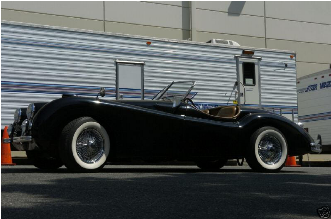
Supersize all thumbnails below